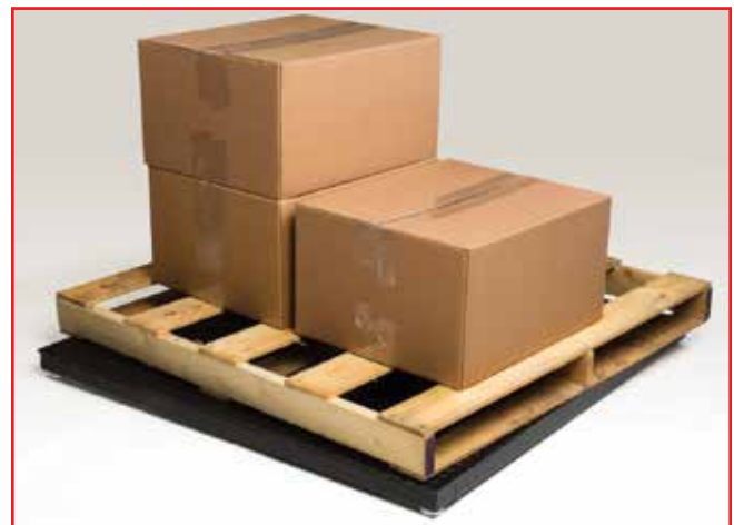
6600 mild steel model pictured.

The parts and components of these Pennsylvania Scale Company products are warranted for five years from the date of retail delivery against defects in materials and workmanship, subject to the terms and conditions of our standard warranty.