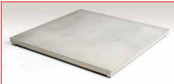
Optional stainless steel construction and load cells provide excellent utility in harsh or wet applications and meet USDA standards.